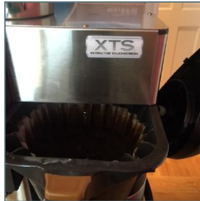
Once your coffee has finished brewing, and the basket stops dripping, remove the basket and empty compost grounds