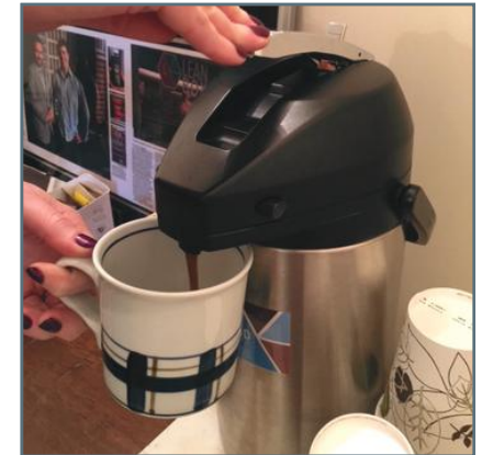
Lift pump lever and serve

QUESTIONS? Text our tech line at 1-800-LEANBOX or check out our website at www.leanbox.com for more training resources