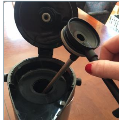
Insert pump and close airpot