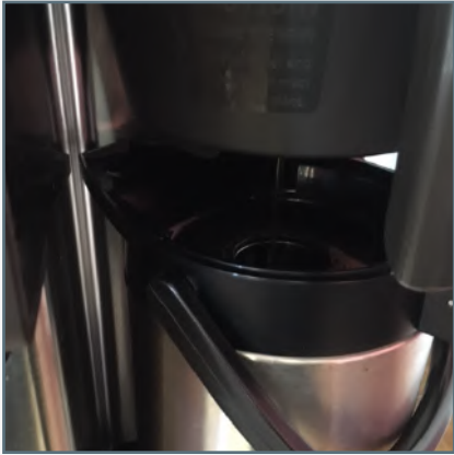
Prepare airpot and place under brewer