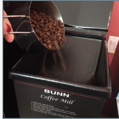
Measure a full 2 cup scoop of beans and place in grinder