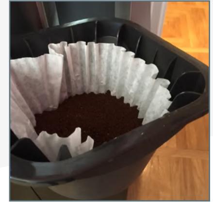
Once full of grounds, place the full filter in the filter basket, and slide into the filter slot